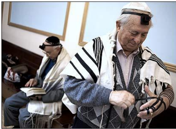
Putting on tefillót