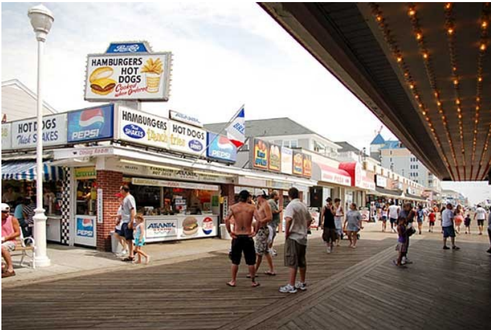
BOARDWALK IN WILDWOOD, NJ