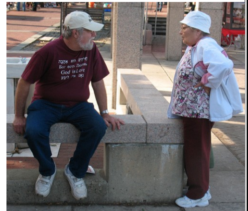
WITNESSING OPPORTUNITIES AT 2009 RUSSIAN MOSAIC FESTIVAL