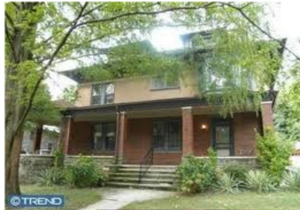
Our Old Home Where We Lived for 29 Years

However, the buyer was not able to sell their home even after we gave them an extension. I had been praying generally for God to help us conclude the deal and sell the house. It was costing us double taxes, utilities, and a large home equity credit line payment. In mid-May, I became more specific in my prayers. I prayed for a better offer, for the buyer to skip the housing inspection, and for a buyer who had no problematic contingences. THE NEXT DAY WE RECEIVED TWO OFFERS WHICH MET THIS PRAYER REQUEST! One of the potential buyers really wanted the home, so they raised their offer $20,000 and met our asking price. This additional funds will go towards our small retirement fund.