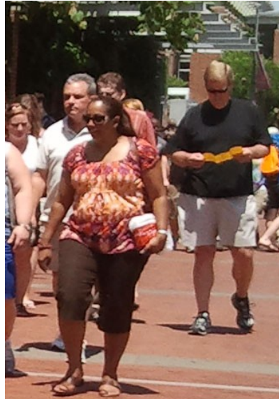
Man on Right Reading AMMI Tract