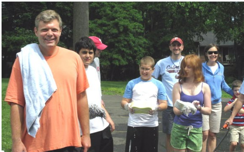
A Few of the Volunteers Who Helped