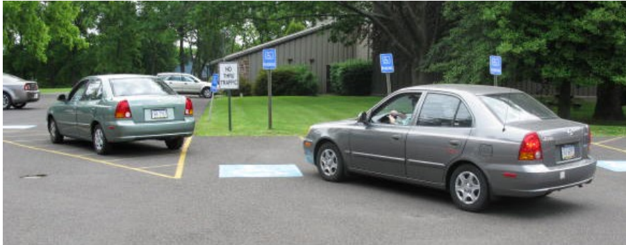
Waiting for Free Car Wash