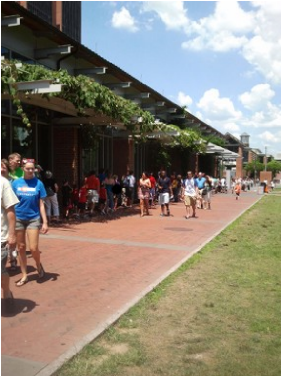
Grassy Area and People Waiting to See

The line of people waiting to get into see the Liberty Bell is usually 125 feet long. I walked along with the line on the grassy part of the mall, which is about 20 feet from the line. As the people slowly moved toward the pavilion entrance, I proclaimed biblical Gospel sound bites. As I looked in the eyes of people, I could see some people listening, while others mocked what was being said.